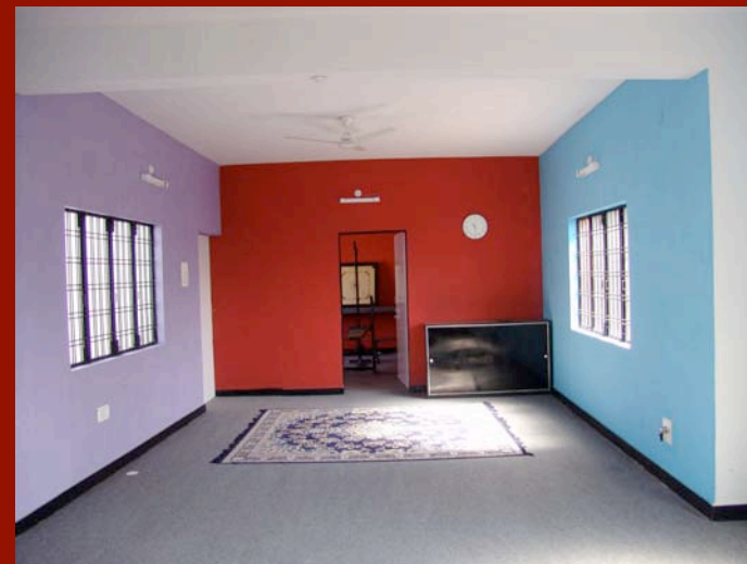
NFI Regional Office – a training room