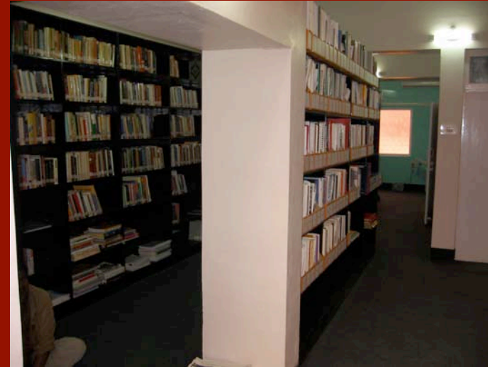
NFI Resource Centre