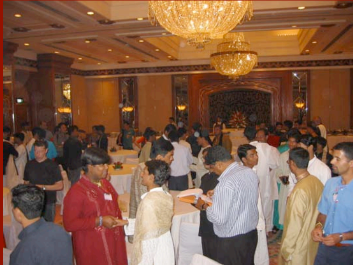
NFI MSM Regional Conference