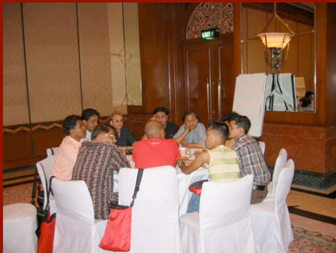
MSM Regional workshop