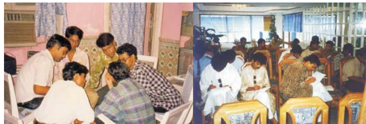
Training workshop in Lucknow, India for kothi identified males

This includes the development of state-level community-based organisations (CBOs) addressing MSM behaviours, which in turn develop district-level activities within their state, with ongoing technical support from NFI.