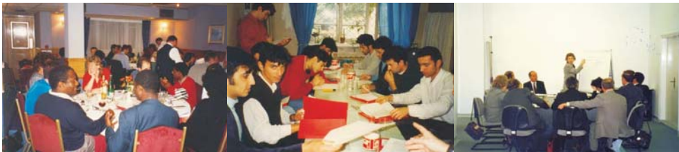
Pan European consultation meeting on HIV and AIDS

Over a decade of direct experience working with MSM and HIV prevention, care and support service development across India, which includes assisting MSM networks to develop their own MSM community-based HIV services, and range of multi-lingual training and capacity-building tool-kits to support this.