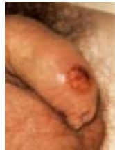
Syphilis - first stage