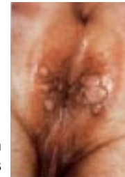
secondary syphilis rash around anus