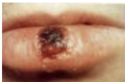
syphilis - on a lip

If you or your partner have any of these symptoms, see a qualified doctor immediately.