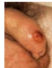
Syphilis - first stage