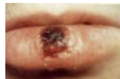
syphilis - on a lip

If you or your partner have any of these symptoms, see a qualified doctor immediately.