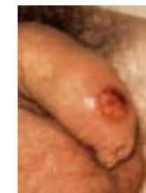
Syphilis - first stage