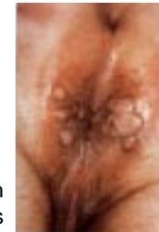
secondary syphilis rash around anus