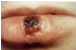
syphilis - on a lip

If you or your partner have any of these symptoms, see a qualified doctor immediately.