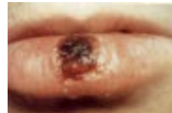
syphilis - on a lip

If you or your partner have any of these symptoms, see a qualified doctor immediately.