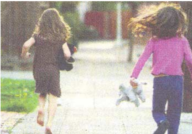
young boy who prefers a skirt and long hair